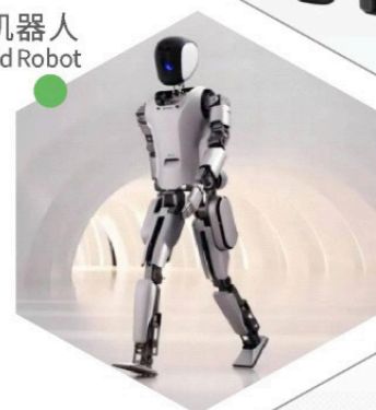
人形机器人 Humanoid Robot