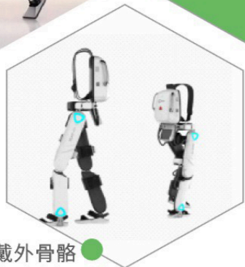
穿戴外骨骼 Wearable Exoskeleton