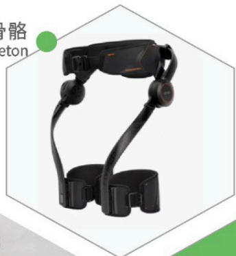
助力外骨骼 Powered Exoskeleton