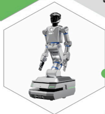
轮式机器人 Wheeled Robot