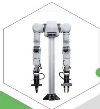
机械手 Robotic Arm