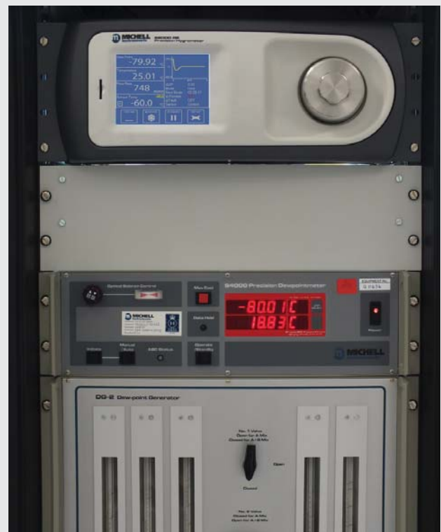
The S8000 RS provides a reliable reference for dew-point calibrations

The S8000 RS utilizes a system called DCC (Dynamic Contamination Correction). The DCC system is intuitive and adapts the instrument control to the operating conditions to achieve optimum measurement performance at all times by periodically re-balancing the optics to compensate for any reduction in light intensity caused by contamination of the components in the optical path. Although the DCC system is fully automatic it can be configured by the user for individual applications.